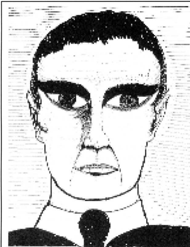
These puzzling, very aggressive, Oriental-type MIBs and their black limousines were active during the intense wave of UFO sightings in Southcentral Tennessee, USA, from 1973 to 1976.

In the Brock case, remember, (Case No.1) the MIB said, "We have people everywhere." In some of my cases the MIBs show an intimate knowledge of all things human. I believe these lying forces of destruction and evil are just beyond your mental fingertips. Kept at bay by the love and truth of our original Creator who exists beyond the furthest galaxy. All too often now dear reader, you perceive the rising crescendo of Evil in its many forms engulfing the entire Earth. There is a special book that constantly warns of it. It is known as "The Bible". ■