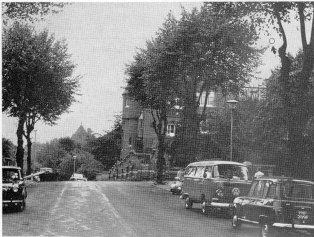
In Lyndhurst Road. Here the light was first seen. Our arrow helps to locate the position of the object which has been drawn by our artist on this and on subsequent photographs (taken by the author some weeks after the incident)

I stopped the car in Netherhall Gardens. The lights remained stationary for a few moments, then began to move off slowly to the right, not at right angles to our forward line of sight, but diagonally away from us. The way they hung stationary, then the direction and