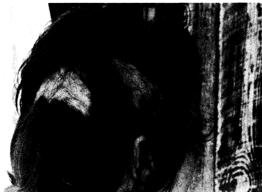
Figure 4 Betty Cash, back of head showing approximately 50% loss of hair