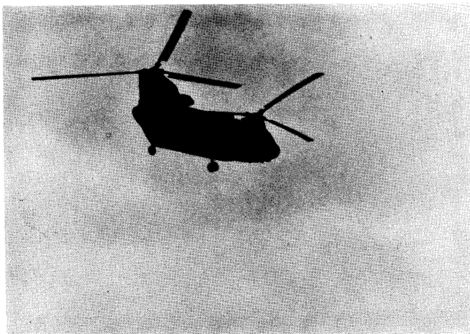
Figure 10 Photo of Boeing CH-47 Chinook helicopter. One of the type of helicopters identified by the three witnesses.