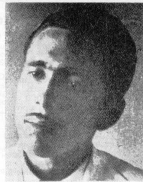
Antônio Villas Boas