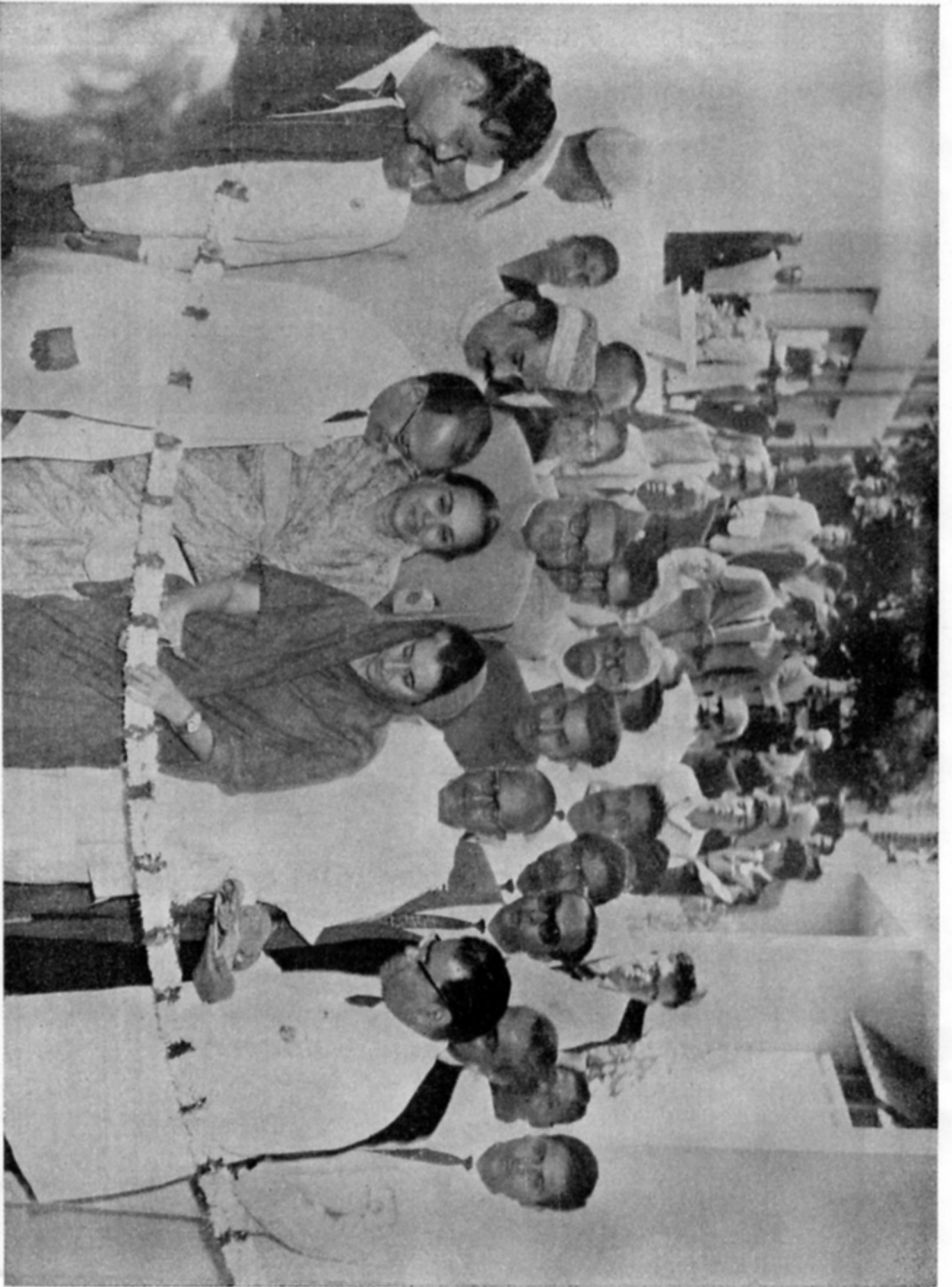
A scene from the inauguration ceremony of Mata Anandamayee Hospital Prime Minister along with Maharaja of Benares and Hospital Staff