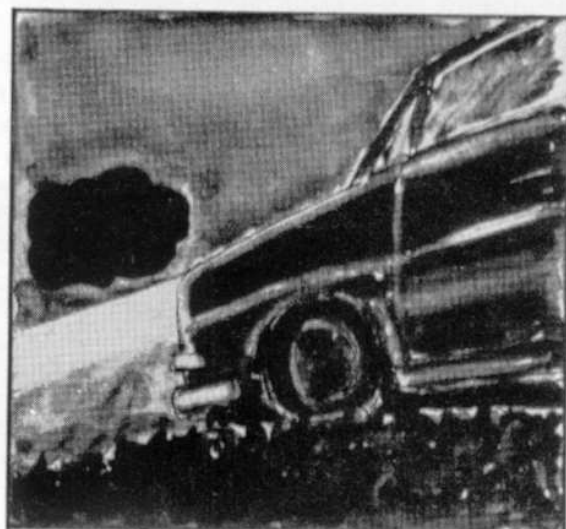
Swedish artist's impressions of 1 Light beams. 2 Blackout. 3 Dark mass rising.