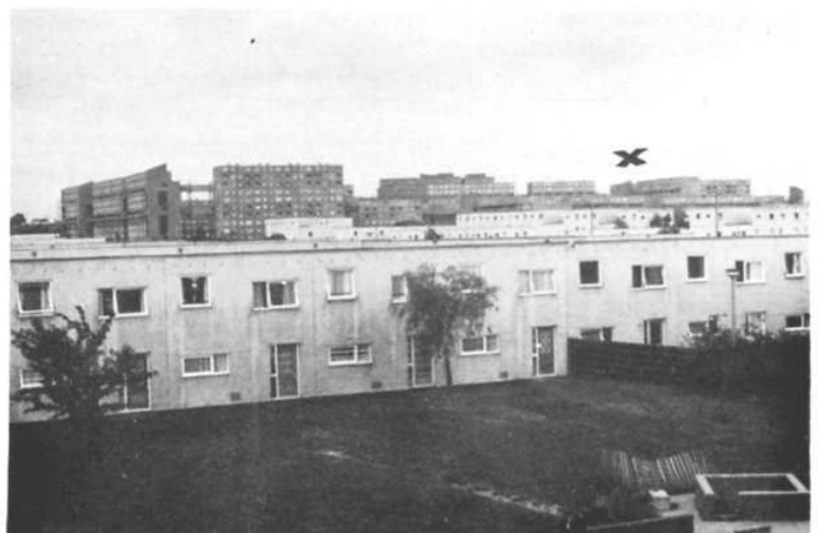
Photo 2: View as the object passed through. X marks the spot where it was last seen.

Another problem has been ascertaining the exact date. All that Linda could recall initially was that it was between late February and early March, but then she remembered that the moon was full that night