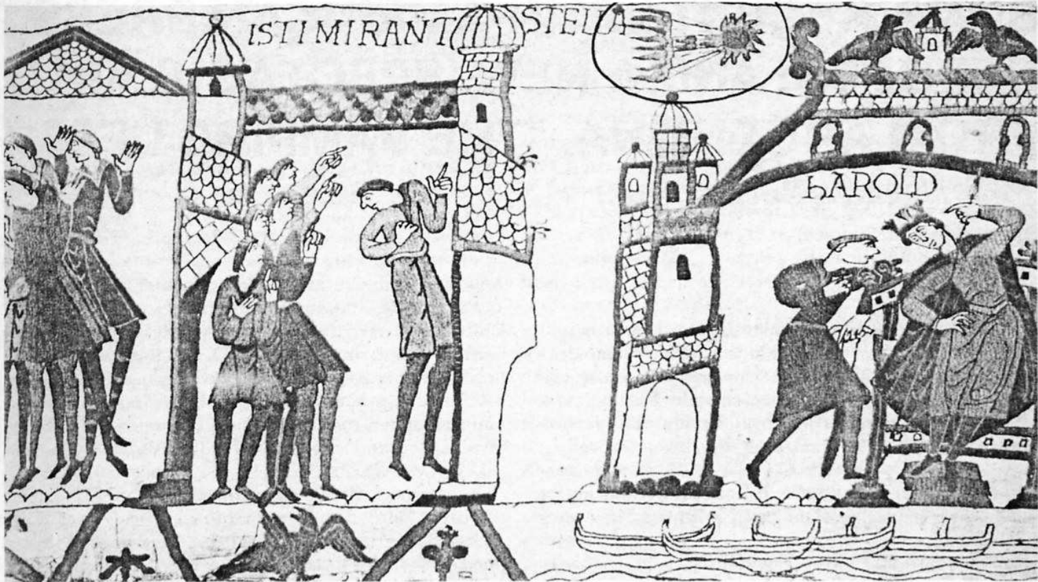
Section of Bayeux Tapestry