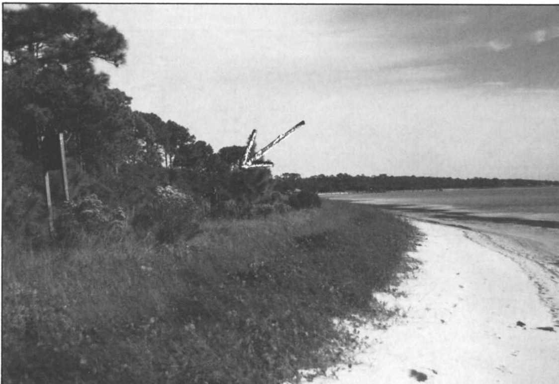
Obscure location of circle.

The circle appears uniformly round and measures approximately seven feet, eight inches in diameter (as a further coincidence note that Dr. Bruce Maccabee has calculated the diameter of the base of the craft in Ed's "roadshot" photo at 7 feet, 8 inches). Direction of