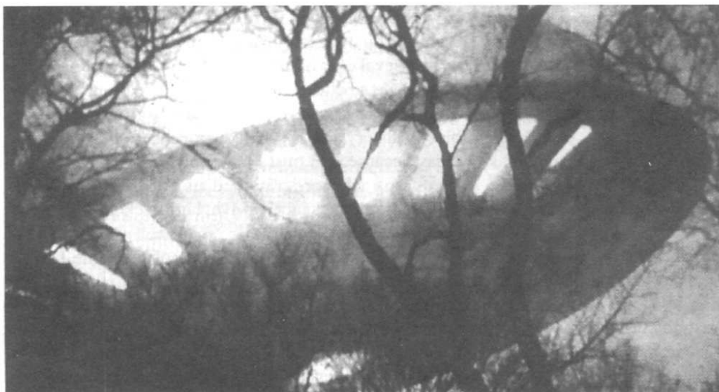
Fig. 2. The Yunque forest, a place very well known for the high incidence of unusual events, such as encounters with UFOs and strange beings, has also been the stage for encounters with blond aliens.

round and come back. Then, about five or ten minutes later, the boy heard footsteps and found himself confronted by a tall man about 7ft tall, with long fair hair - almost white hair - right down to his shoulders, and very white skin, in other words, very much like what we call an " albino ". (The moon was full, so the boy saw him clearly).