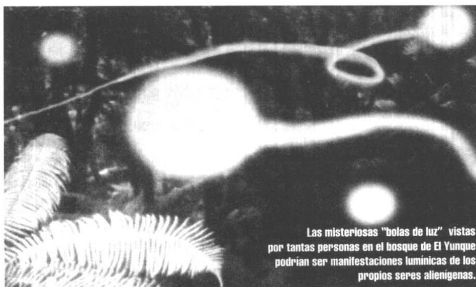
Las misteriosas "bolas de luz" vistas por tantas personas en el bosque de El Yunque podrían ser manifestaciones luminicas de los propios seres alienígenas.

back and again he was overwhelmed with the sensation of still being observed.