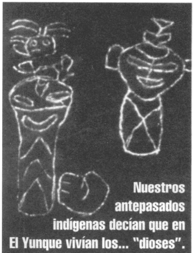
Fig. 1. Our indigenous ancestors said that in the Yunque there lived the "gods."

And one night, while they were all there in the sister's