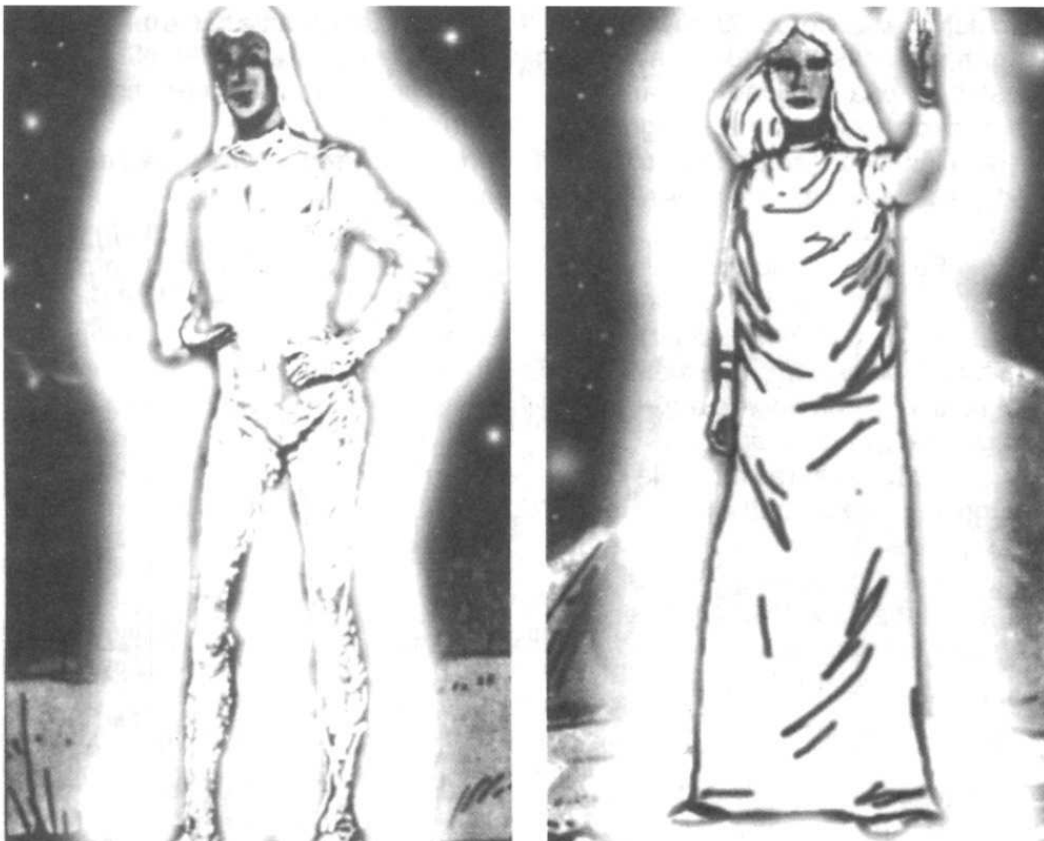
Fig 5. Two of the types of blond beings seen in the Yunque.