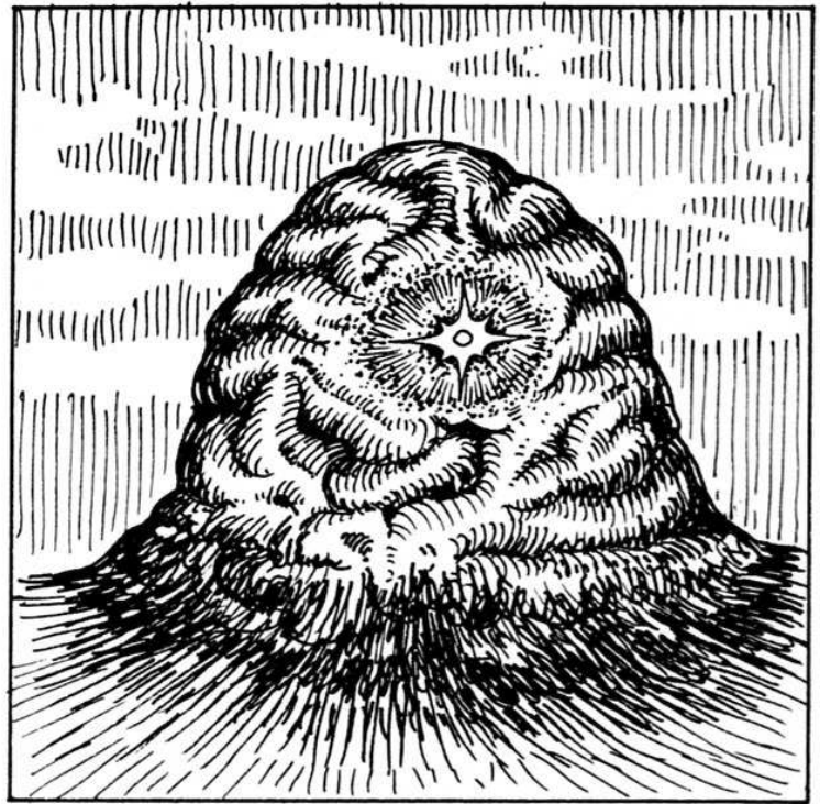
Figure 1 Rodriguez' sketch of entity

Rodriguez did not state that the barely-audible