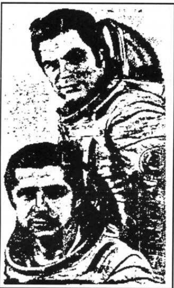
Cosmonauts Kovalyonok (top) and Savinykh.