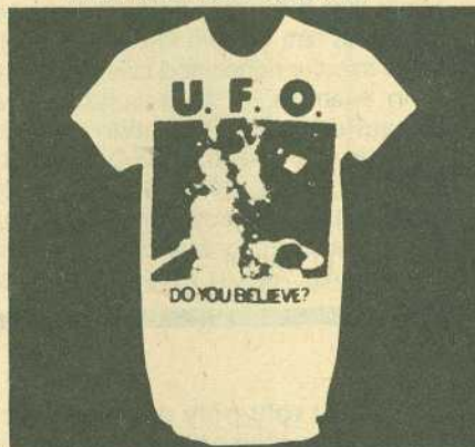
E (T-Shirt) DO YOU BELIEVE?