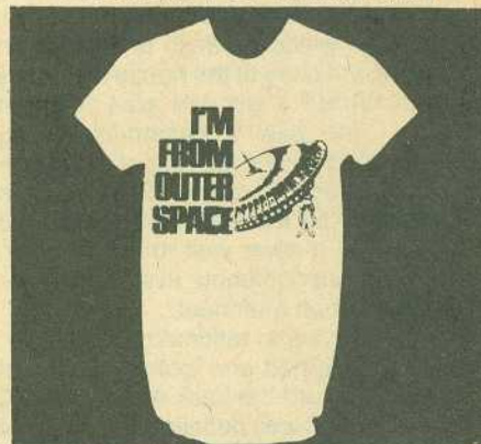
F (T-Shirt) I'M FROM OUTER SPACE

The silk-screened, color-fast, Fruit of the Loom® T-Shirts are only $4.00* each, while the durable, heavy-duty Sweat Shirts, featuring a thick cotton base, are only $6.50* each. Both products are fully washable.