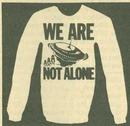
A (Sweat Shirt) WE ARE NOT ALONE