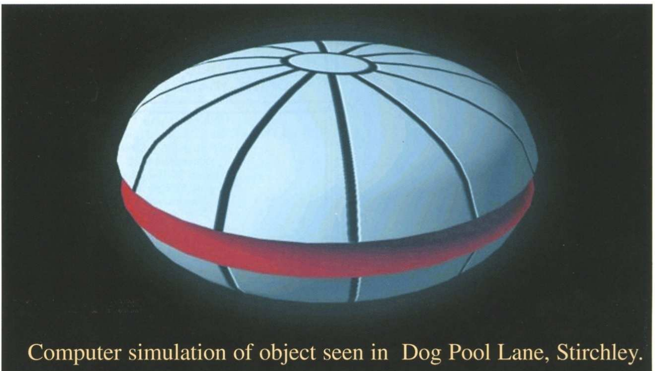
Computer simulation of object seen in Dog Pool Lane, Stirchley.

We discovered that, according to the MOD, there was an unexplained aerial sighting 'reported to them as having been seen at 10 pm over the Lichfield area'. The authors strongly refute the thinly veiled suggestion, made in the newspapers after this event had taken place, that what had been seen was a meteorite! ■