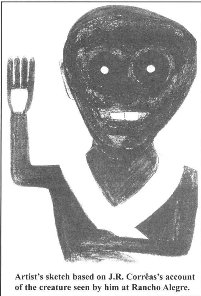
Artist's sketch based on J.R. Corrêas's account of the creature seen by him at Rancho Alegre.

HAIR: "Reddish-brown -the colour of ground coffee. But a bit deeper in shade than that. Hair sticking up rather - pulled a bit to one side. Had quite a big topknot sticking up".