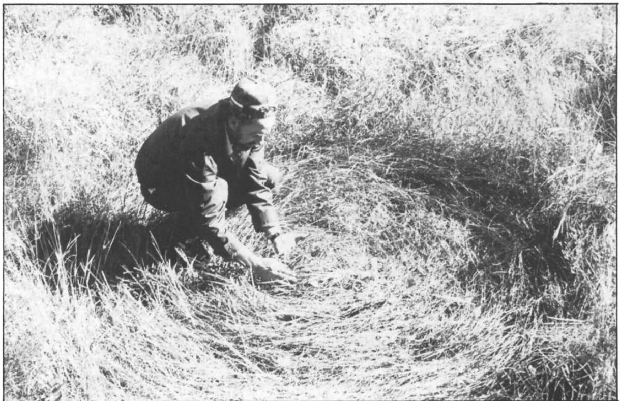
The central whorl.