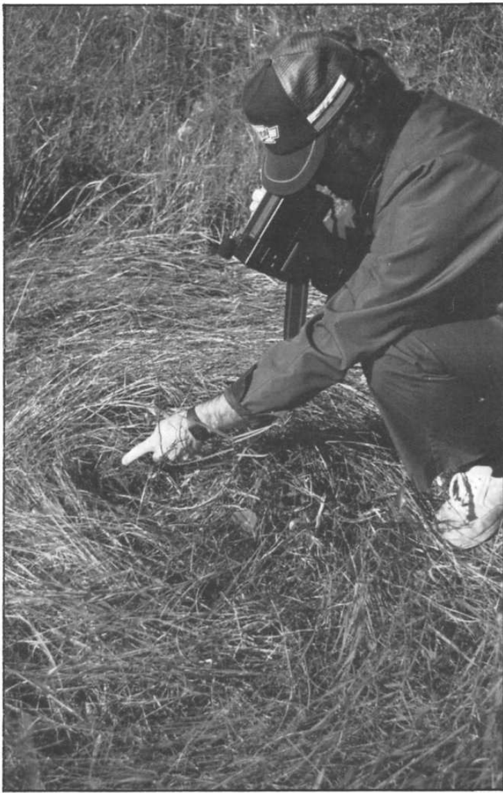
Ed Walters examining central whorl (photo by Duane Cooke, Editor "GULF BREEZE SENTINEL").