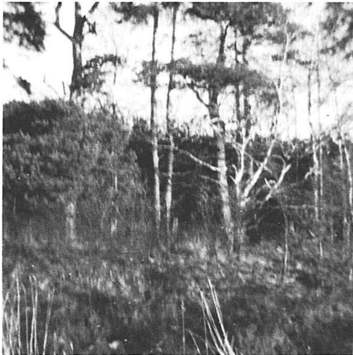
New Elgin landing site — mid foreground — with fence and trees in background.

Sketch by author of UFO at landing site.