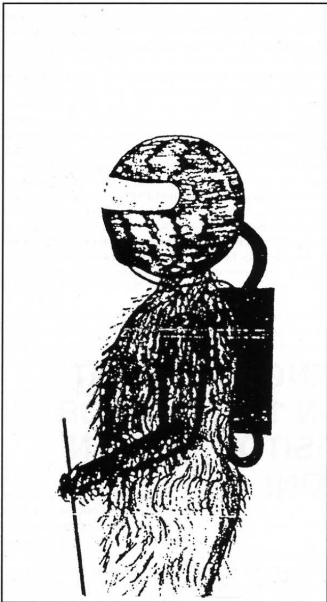
Profile view of the "sonde balloon".

We would however inform you that, following upon the enquiries made subsequent to the reception from the Corps of Carabinieri of the facts as reported to them by COCOZZA, it has been ascertained that, on the day in question, sonde balloons