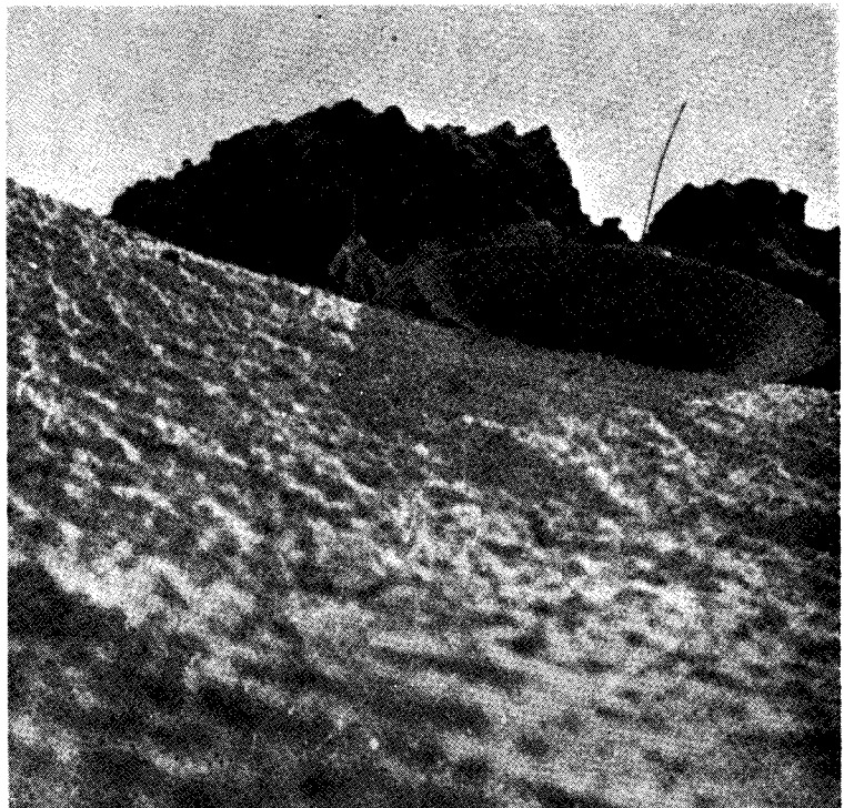
Monguzzi photograph, showing "Humanoid"

Personally, I have always felt that the photographs were far more likely to be genuine than not, and I now note with much interest that, in a footnote