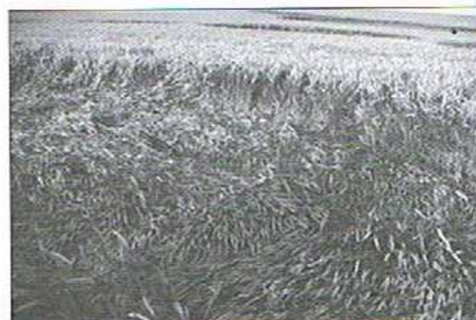
East Field - untouched area of formation around 5am - W. Keech 2007

Was this formation a hoax? No it was not! I would not be very interested in it at all if it was, nor would I stand up and face this barrage of hostile fire to bring it forward if it was anything less than important. Not only is there no sign of hoaxing in the video (almost continuous from 11pm to 4am), the difficulty of surveying a massive and perfect formation in the cloudy, almost pitch darkness of that night; with camera killing wind driven condensation combined with the difficult topography of the field itself almost instantly rules it out. For me, as soon as I saw the message I knew it could only be genuine. When the scientist in me entered the almost untouched formation and saw multi-weave lays and expulsion cavities in the un-buckled stalks I knew for certain. (To non-crop circle initiates this evidence of gross intense heat across the crop and intricate multilayered design has always been a benchmark of authentic formations).