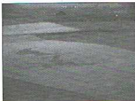
Sony vx2100 3 30am 070707 Frame grab

Much has been said about the 777 crop formation in East Field at Alton Barnes in Wiltshire, some commentators have ventured sweeping claims without any examination of the depth of the evidence. My reputation has been questioned by people who don't even know me and I certainly don't need them to tell me who they think I am or what I have witnessed and recorded. The phenomenon itself has danced with me for