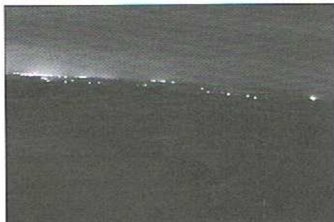
East Field 1:23 am 07:07:07 Sony dsc-1717 oss400 10sec f2.0 1x zoom

of that; this is my understanding of what was shown to me that night. I have written for this publication (FSR) because I have met members of its staff over the years, out on those hilltops in the dark and rain trying their hardest to understand and record just this. In spirit this is as much their success as it is my own.