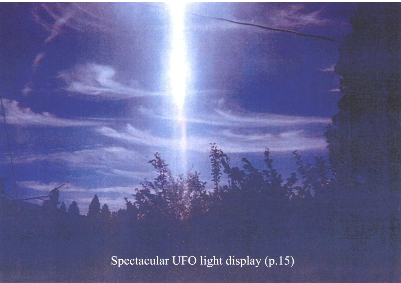
Spectacular UFO light display (p.15)