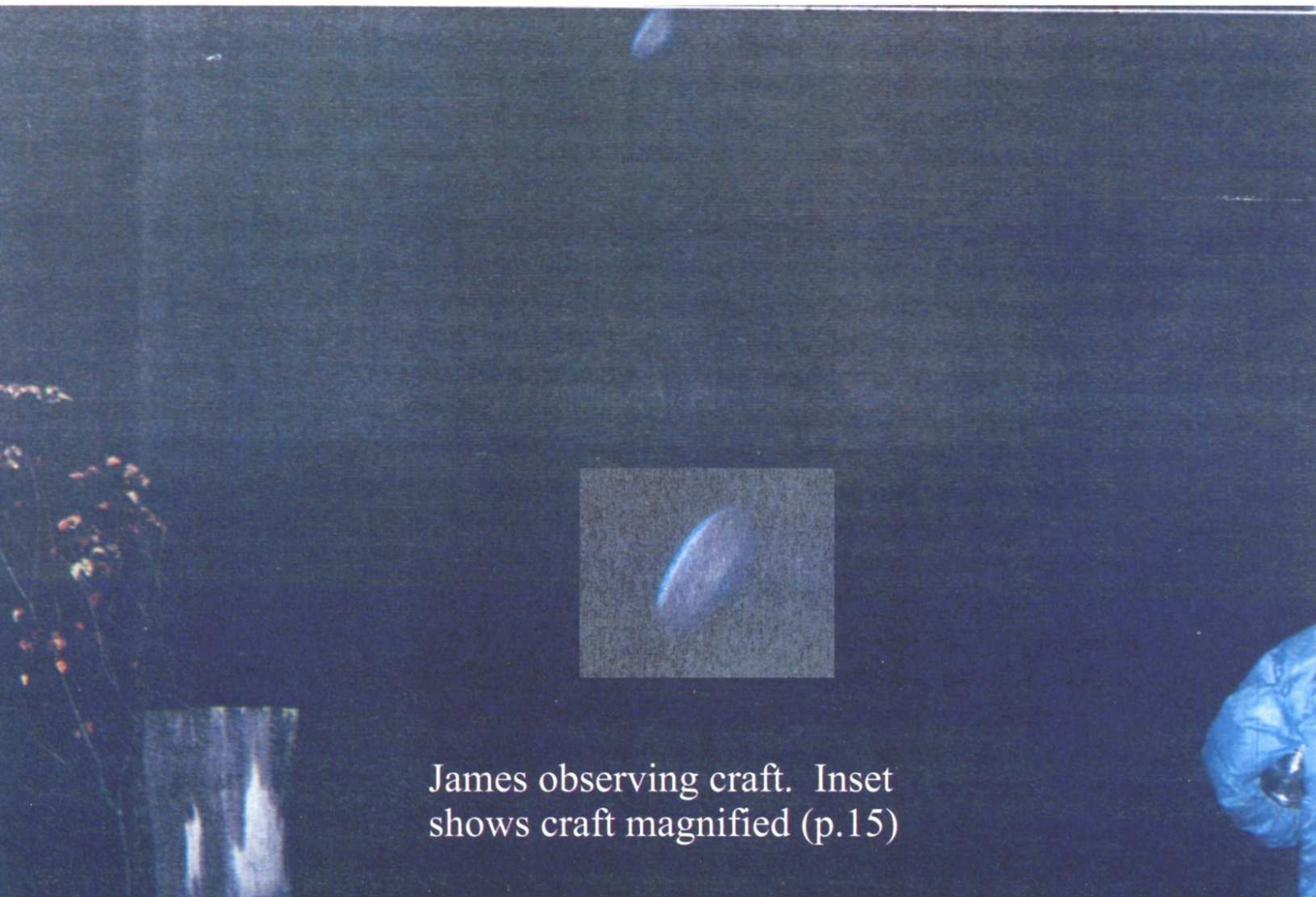
James observing craft. Inset shows craft magnified (p.15)