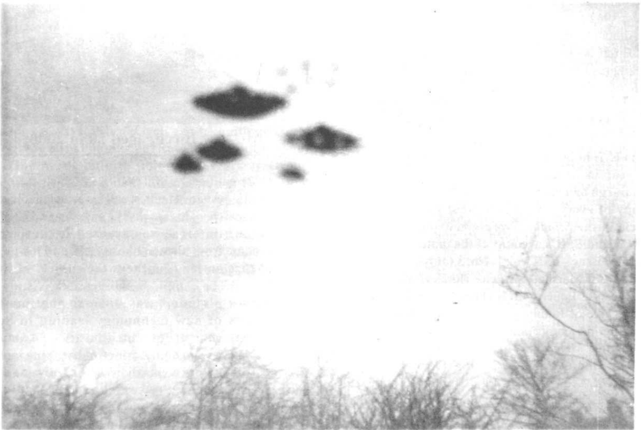
at Mosborough, Sheffield, Yorks, on March 4th, 1962.