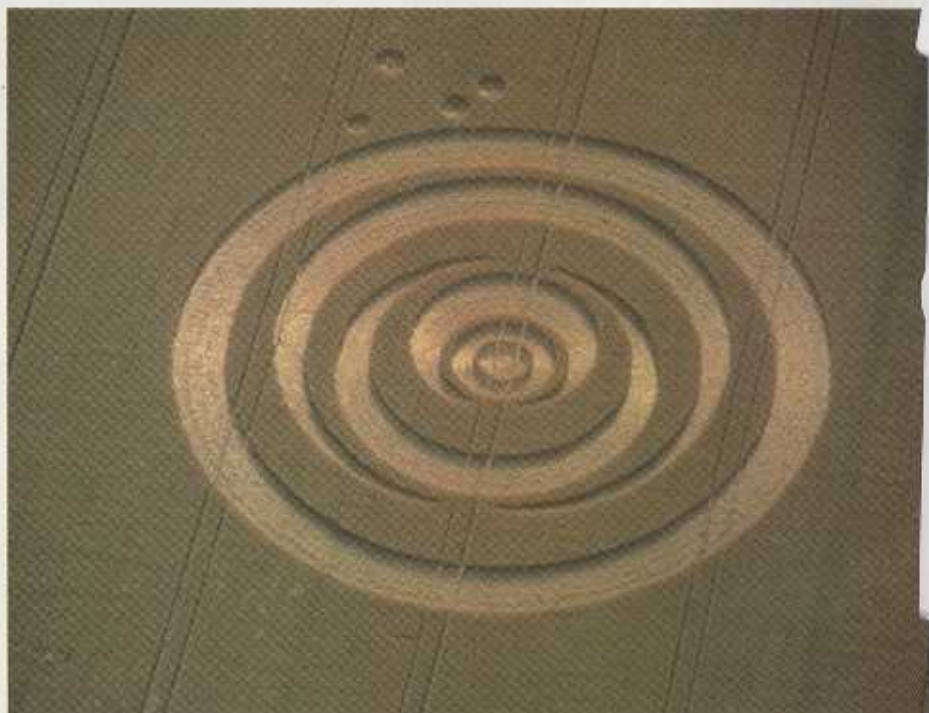
Above: This crescent-based agriglyph appeared near East Meon, Hampshire, in July 1995.

The physical and chemical anomalies clearly show that crop circles are abnormal formations, but perhaps more convincing than any other evidence is the effect they have on people who see encounter them. Lucy Pringle of the Centre for Crop Circle Studies (CCCS) in England has gathered a wealth of