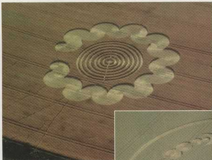
Top: Litchfield, Wiltshire, July 1995. This agriglyph appeared in a wheat field in the early morning hours. Although it was beside a busy motorway with thousands of cars speeding by, few people stopped. Later, investigators showed a skeptical local police officer how to dowse within the circle. He achieved amazing results.