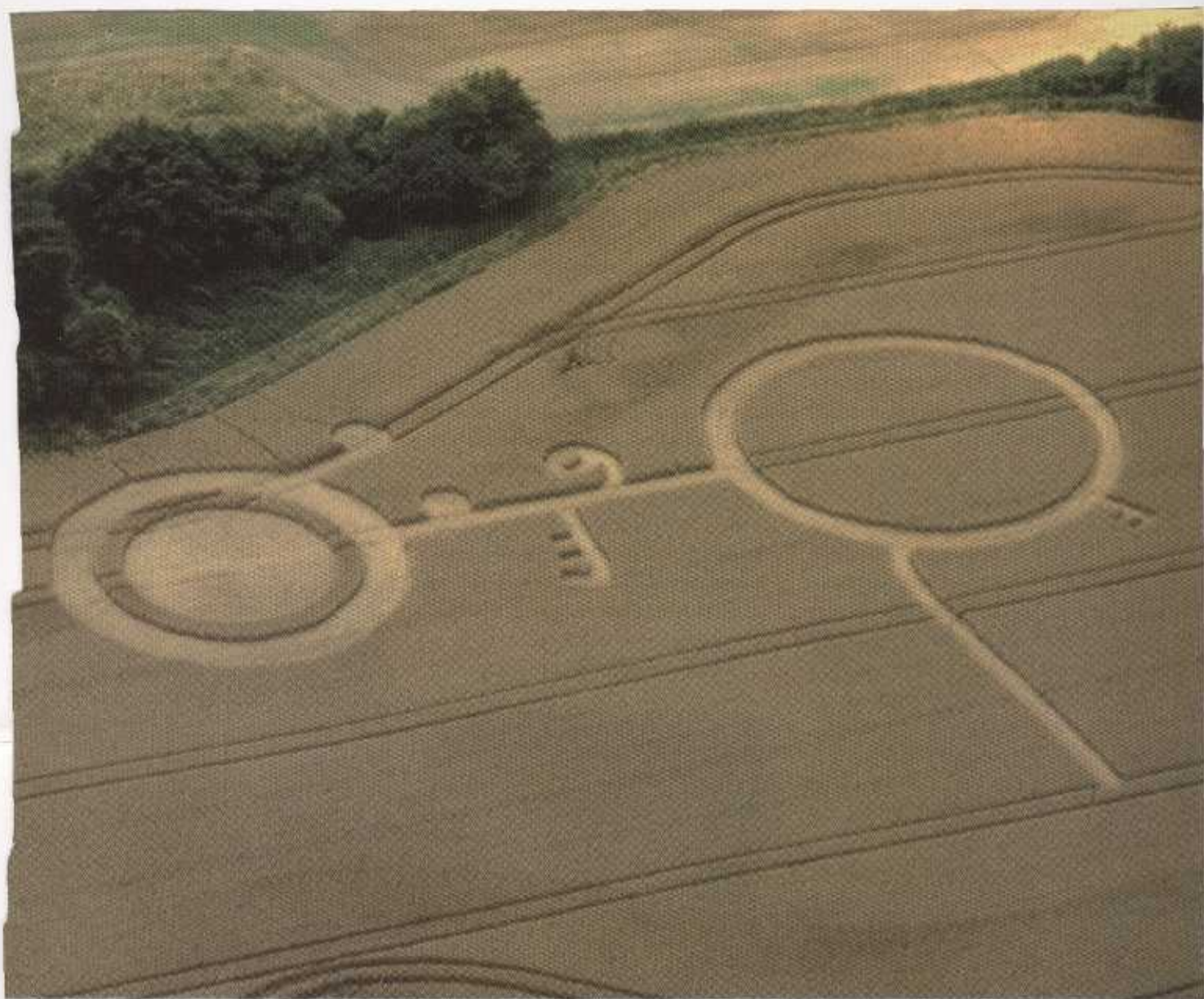
Opposite page: Onlookers view a 1994 formation below a Neolithic site known as Oliver's Castle near Devizez, Wiltshire. (All the photographs in this article were taken in England.) Above: This 200-foot glyph appeared in a field near Cheesefoot Head, Hampshire, in 1993. Researchers are still trying to decipher the complex glyph's meaning.

Quite suddenly, we saw a giant snail-shaped formation in the fields on the east side of the road. We were not the first to discover it. In fact, scientists were measuring it, artists were drawing it, and others were simply experiencing it. We stopped and paid the farmer an admission fee of 50p (around 85¢). When we went in, I was overcome with awe. The formation was beautiful, but more than that, I felt gently bombarded by unusual energies. In later crop circle visits, the energy felt transformational. It seemed to spin and realign me spiritually.