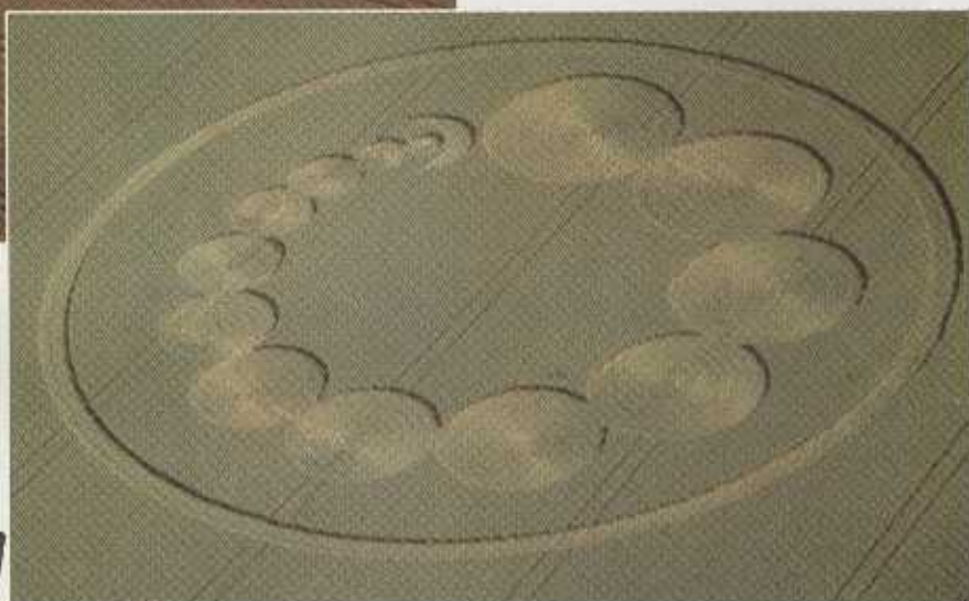
Bottom: Mayan lunar calendar design, also called the sleeping serpent, Avebury, 1994.

be designed to help us avoid the more radical surgery of catastrophic changes which so many seers predict as we near the end of this millennium.