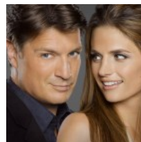
The Real Reason Why 'Castle' Got Canceled