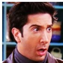
How Much Each 'Friends' Star is Worth Today