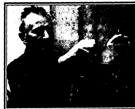
STANISLAW SZUKALSKI at work (from Behold!!! The Protong )

Szukalski was born in Warta, Poland and quickly distinguished himself as a major artistic talent; he first exhibited his work when he was only 14. He emigrated to the United States with his blacksmith father and ended up in Chicago, home of a sizable Polish community. Szukalski met with favor on this side of the Atlantic, and was soon keeping company with such luminaries as Ben Hecht, Carl Sandburg,