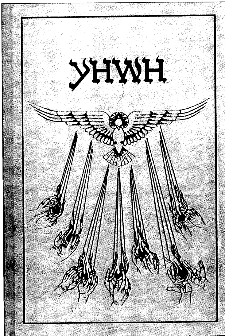
The Keys of Enoch