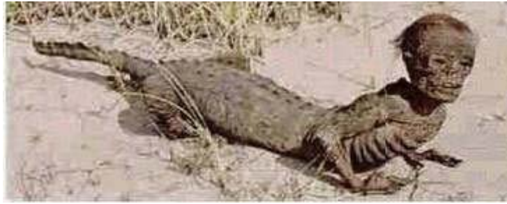
Not saying this photo is real but mostly for example purposes.

If a mutant “might” look like this, they are either Satanists who got stuck in a morphing process; or more commonly, devils and/or scientists experimenting with human embryo. As we advance in technology we will have more abnormalities because of radiation, but again this is a satanic plot; and some honest people would have become victims of mutation. When I wrote this in the newsletter, X-men 2 had just been released that weekend and many young people flocked to the theater to be deceived. A month later, the Incredible Hulk was released, and who could forget the Box Office recording breaking film, Spider-Man, in 2002. Though these movies seem innocent, to the point that an ardent follower of Christ like myself is greatly enticed to watch them, they are laden with underline satanic themes to brainwash the public. Pray for your children and families, because “the days are evil.”