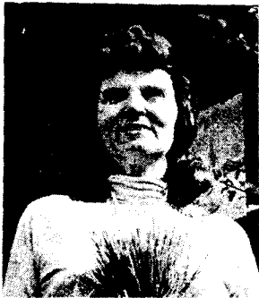
Ann Wigmore D.D.