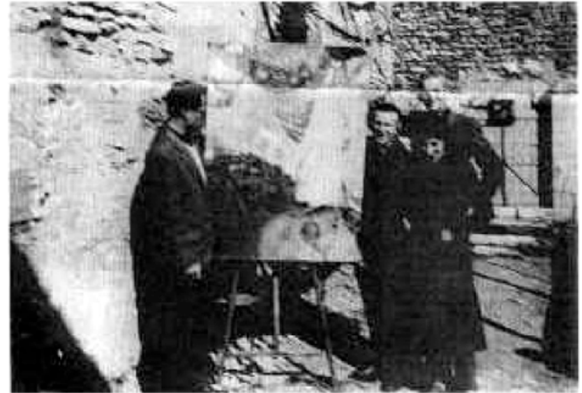
Varian Fry, Marc Chagall, Bella Chagall and Hiram Bingham IV, at the Chagalls' home in Gordes, in March 1941, the weekend they planned the Chagalls' escape from Vichy France.

During the weeks following the German conquest of France in June 1940, thousands of refugees, many of them Jews, fled to southern France to avoid capture by the Nazis. Among the refugees were many prominent political dissidents, intellectuals,