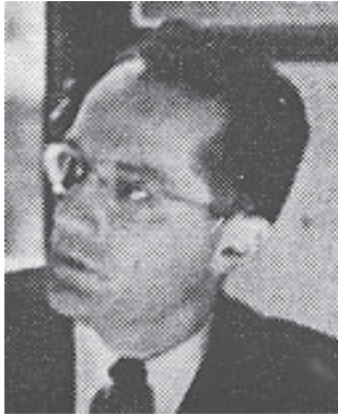
Varian Fry 1907-1967

Feuchtwanger, in Bingham's car, made it through German checkpoints to the vice-consul's country house, where he hid until Bingham could help get him out of the country.