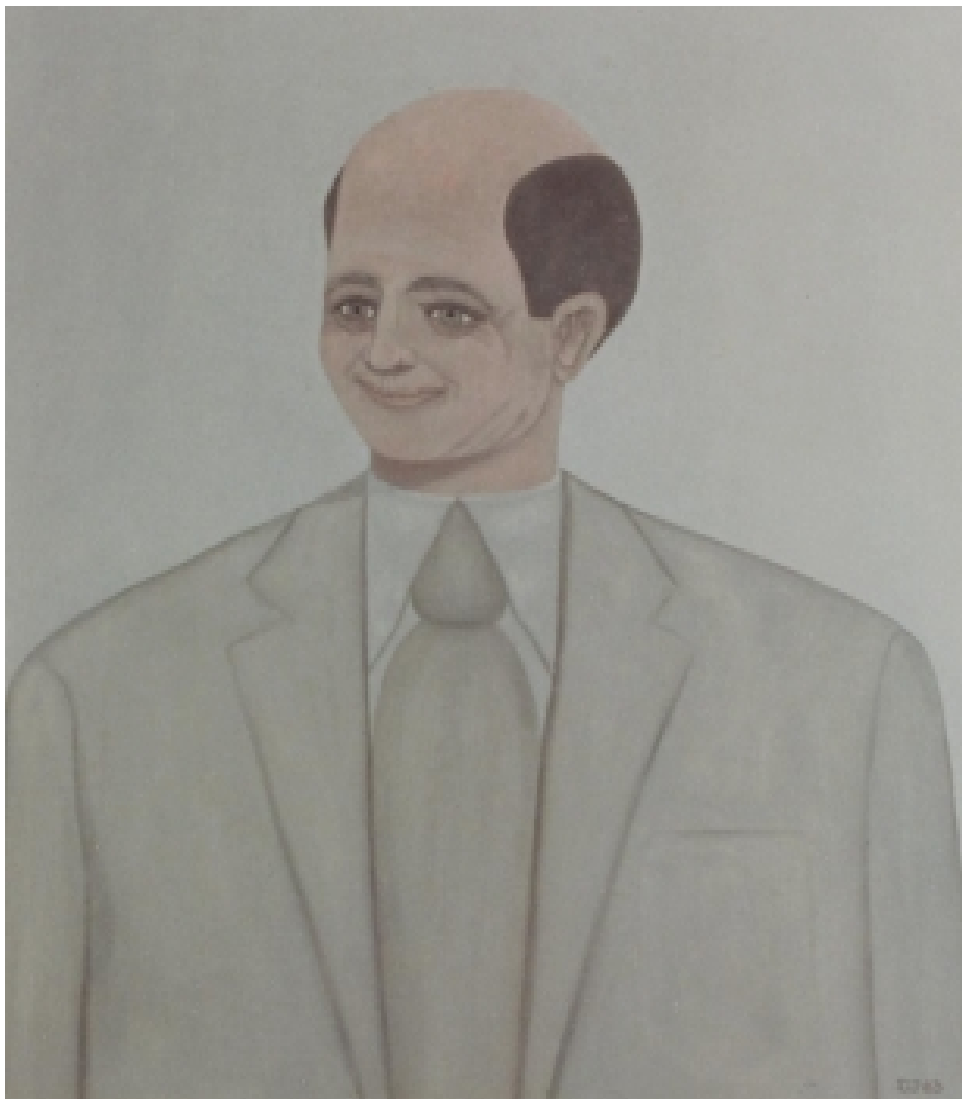
[II]-MAN IN THE GREY FLANNEL SUIT HANGING LOOSE