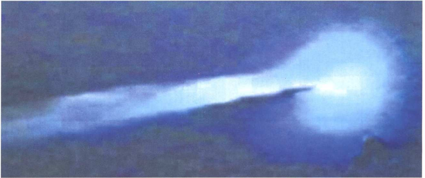
UFO 'close-up' over San Luis Potosí, Mexico, at 0100 a.m. on January 28, 1996, greatly resembling sighting at 0042 hrs a.m. over Monaghan district, Ireland, on January 16, 2001.

Today, 43 years later, now living in Canada, he has again contacted us and explained how he had been driven into "confessing". We plan to publish the whole story in a future issue of FSR.