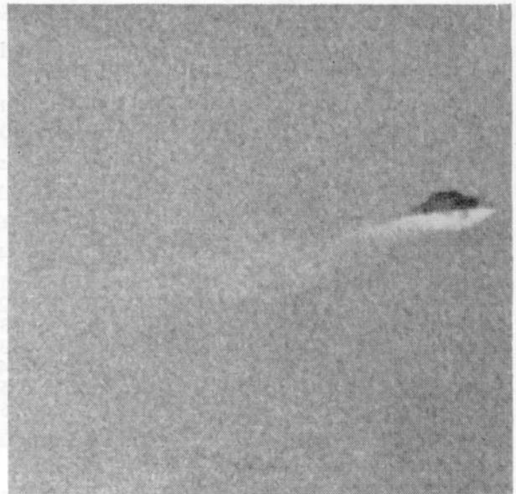
Fig. 1 (left) and Fig. 2 (above).