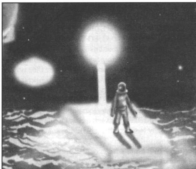
Fig. 2. Sketch by Jorge Martín based on description given by witnesses.

Torres now had his binoculars. The entity was wearing gloves and boots of the same white colour. No sound whatever was heard from the figure or the platform and no sound of any engine. Torres reckoned the speed of movement of the platform was about 10 - 15 kms p.h.