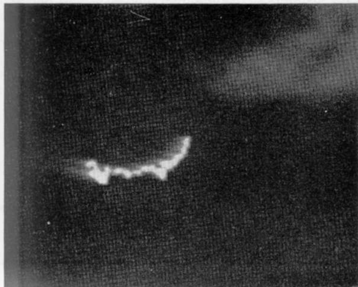
Masahiro Asanuma's first photograph

There was another photograph taken during the early morning of the next day, September 23, in Osaka City. This was reported in the Nippon Keizai Shinbun of September 28 as follows: "On September 27, when the UFO photographed over Okinawa became a topic