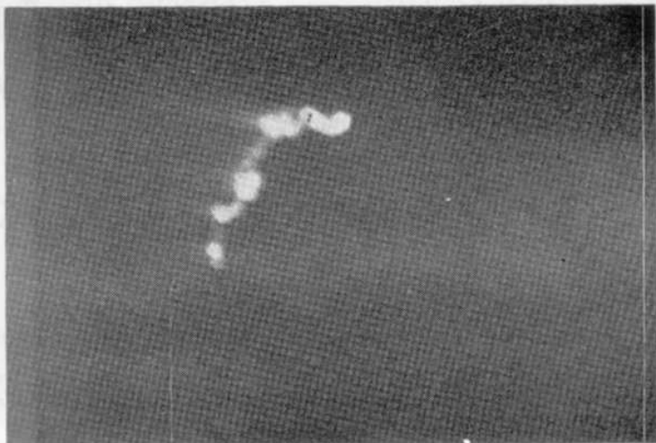
Asanuma's second photograph: eyewitnesses described the object's swift direction changes, but there also appears to be a degree of hand-shake