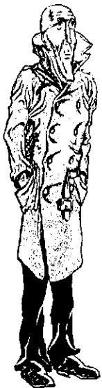
Illustration by Blade Galentine

T he systematic classification of beings reported by UFO witnesses began more than twenty years ago. The best such attempt was clearly that of Jader Pereira , who processed 333 reports of possible extraterrestrial entities . He classified 12 different types , each with several subtypes. 1 At present, however, it could be very risky to continue employing his classification, despite its excellence. His sample is obviously too small for our use today.