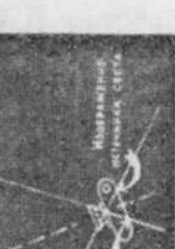
2. Вид фототарелки. Излучение от источника света падает на объектив и отражается от поверхности. Вид фототарелки.

Таким образом, разницы между фототарелкой, которую мы получили, и фототарелкой, которую мы получили, нет. Так и фототарелка, которую мы получили, и фототарелка, которую мы получили.